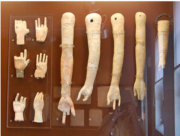
Ex Votos from Sanctuary of Asklepios