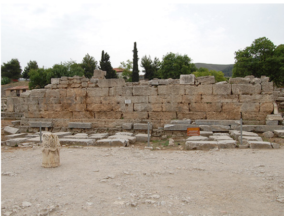
The Bema Judgment Seat