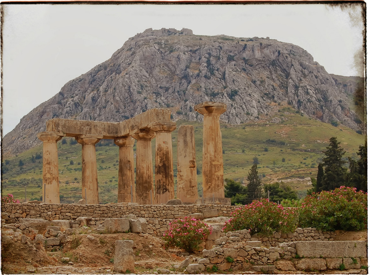
The Temple of Apollo at Corinth

“To the church of God which is at Corinth, to those who are sanctified in Christ Jesus, called to be saints, with all who in every place call on the name of Jesus Christ our Lord, both theirs and ours: grace to you and peace from God our Father and the Lord Jesus Christ” (1 Corinthians 1:2–3)