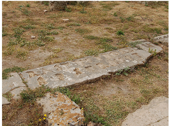
The Erastus Inscription