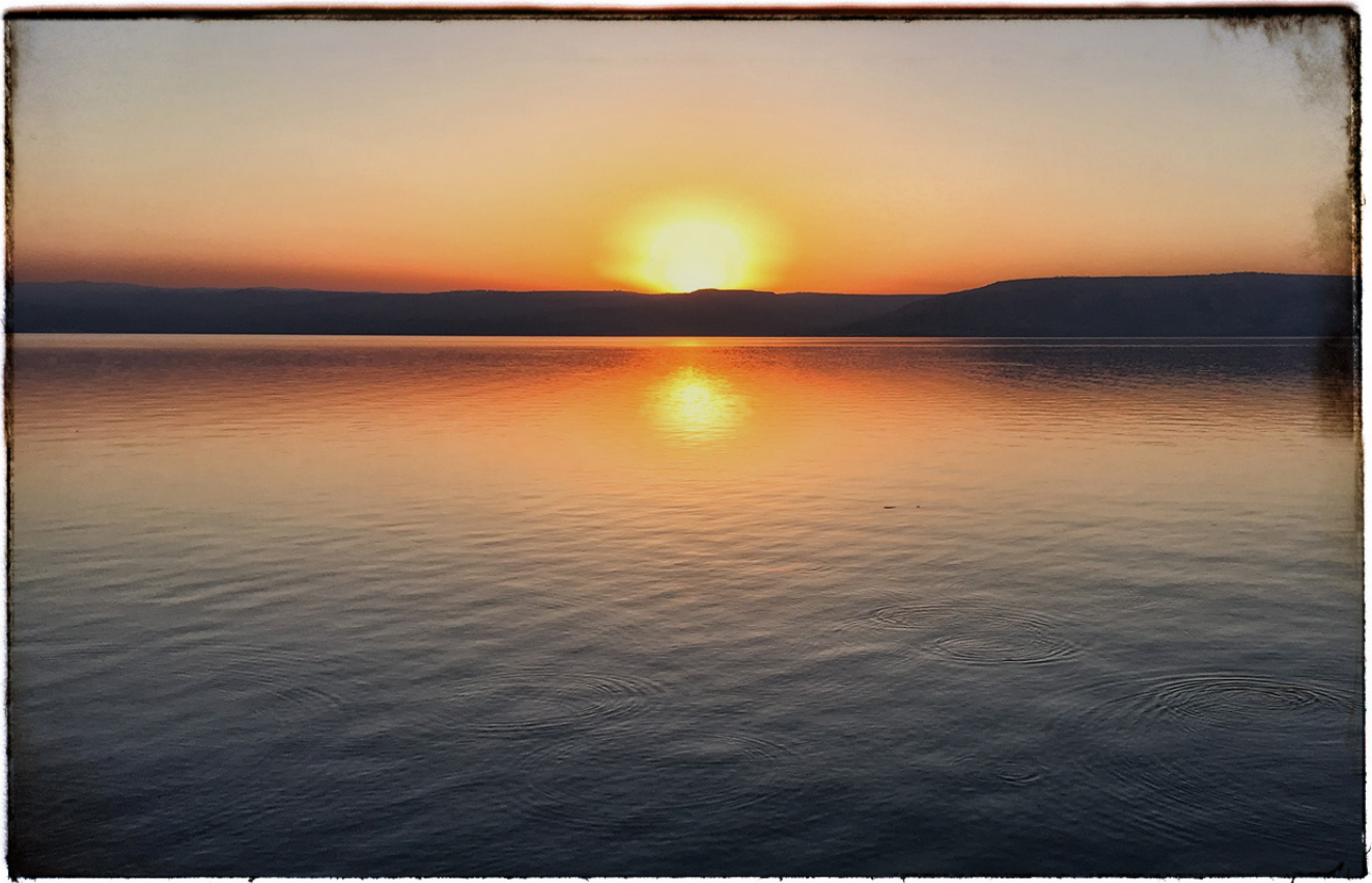
Sunrise on the Sea of Galilee

“Now after John was put in prison, Jesus came to Galilee, preaching the gospel of the kingdom of God, and saying, ‘The time is fulfilled, and the kingdom of God is at hand. Repent, and believe in the gospel.’” (Mark 1:14–15)