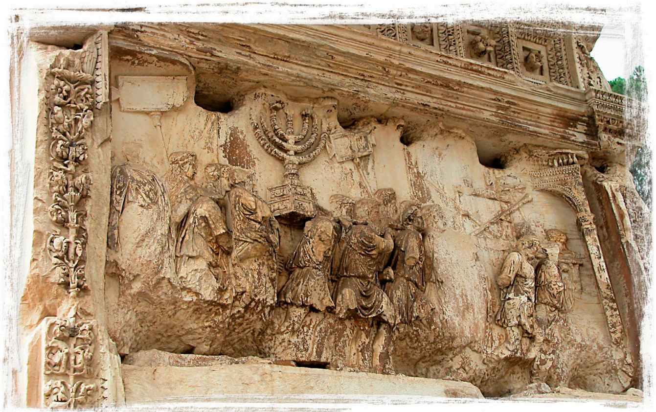
Detail from the Arch of Titus showing the sacking of Jerusalem. Note the Menorah being carried away. The monument is located on the Via Sacra just to the south-east of the Forum in Rome.

“Speak to all the congregation of the children of Israel, and say to them: ‘You shall be holy, for I the Lord your God am holy’” (Leviticus 19:2)