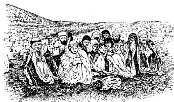
Lepers by the Road