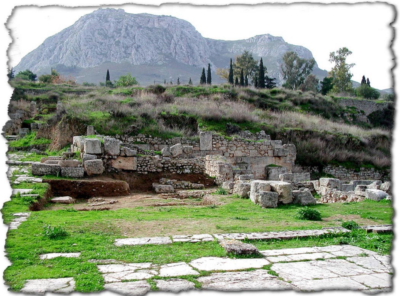
Area of the Erastus Inscription

“Paul, an apostle of Jesus Christ by the will of God, and Timothy our brother, to the church of God which is at Corinth, with all the saints who are in all Achaia...” (2 Corinthians 1:1)