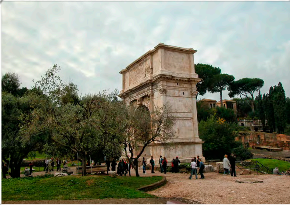
The Arch of Titus in Rome