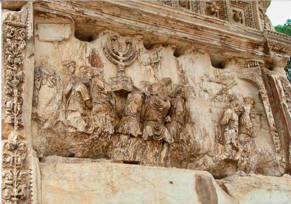
The Arch of Titus in Rome