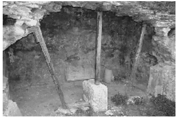
Inside the Jail