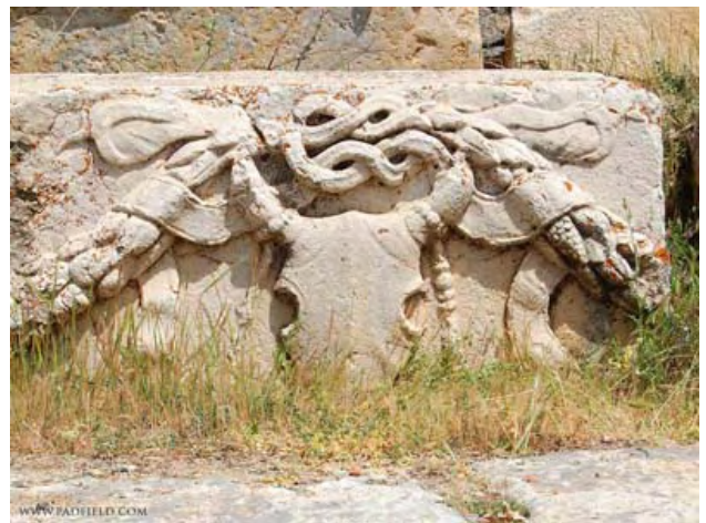
Garlanded Bull's Head