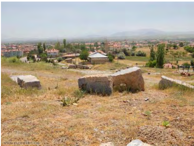
Village of Yalvac