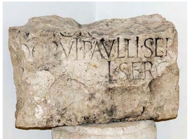
Sergius Paulus Inscription