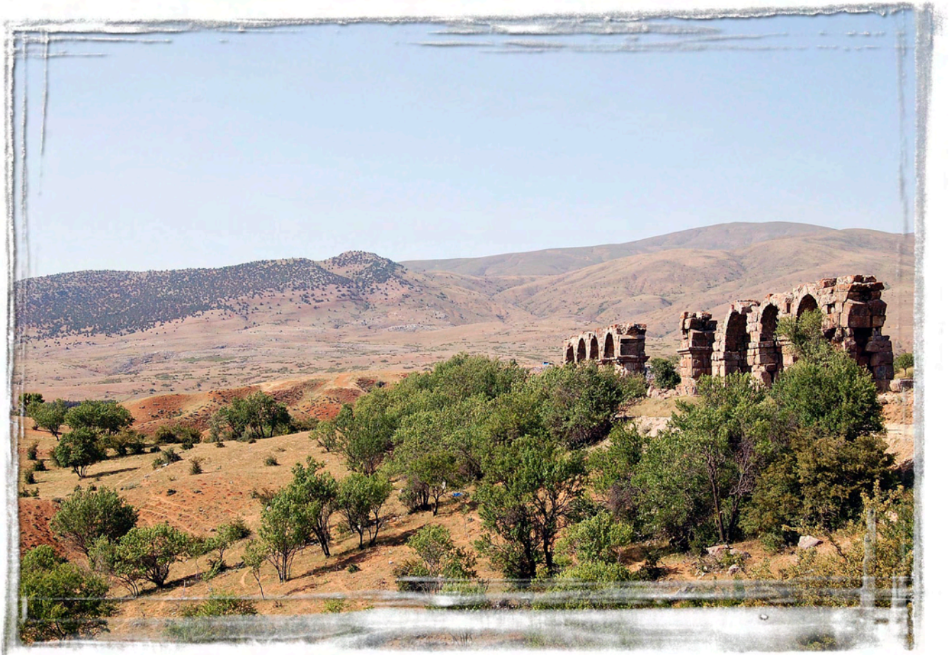
Roman aqueduct at Antioch of Pisidia

“But when they departed from Perga, they came to Antioch in Pisidia, and went into the synagogue on the Sabbath day...” (Acts 13:14)