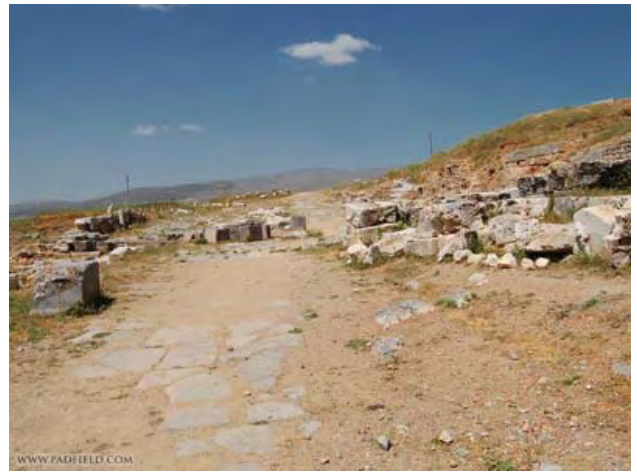
Foundation of Triple Arch