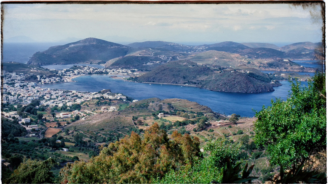
The town of Skala on the Isle of Patmos

“That which was from the beginning, which we have heard, which we have seen with our eyes, which we have looked upon, and our hands have handled, concerning the Word of life—the life was manifested, and we have seen, and bear witness, and declare to you that eternal life which was with the Father and was manifested to us—that which we have seen and heard we declare to you, that you also may have fellowship with us; and truly our fellowship is with the Father and with His Son Jesus Christ” (1 John 1:1-3)