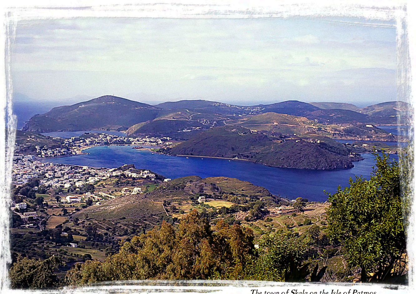
The town of Skala on the Isle of Patmos

“That which was from the beginning, which we have heard, which we have seen with our eyes, which we have looked upon, and our hands have handled, concerning the Word of life—the life was manifested, and we have seen, and bear witness, and declare to you that eternal life which was with the Father and was manifested to us—that which we have seen and heard we declare to you, that you also may have fellowship with us; and truly our fellowship is with the Father and with His Son Jesus Christ.” (1 John 1:1-3)