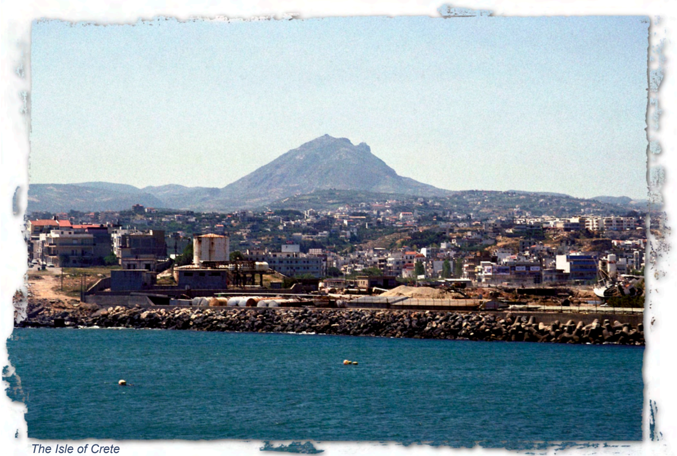
The Isle of Crete

“For this reason I left you in Crete, that you should set in order the things that are lacking, and appoint elders in every city as I commanded you” (Titus 1:5)