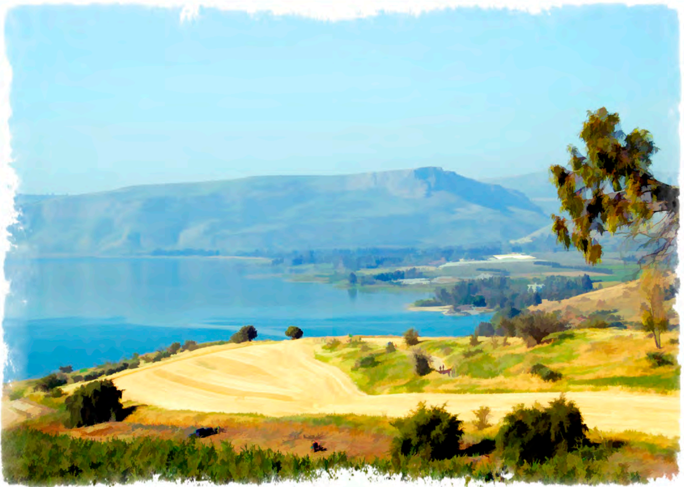
Northern shore of the Sea of Galilee

“When Jesus saw the crowds, He went up on the mountain; and after He sat down, His disciples came to Him. He opened His mouth and began to teach them...” (Matthew 5:1-2)