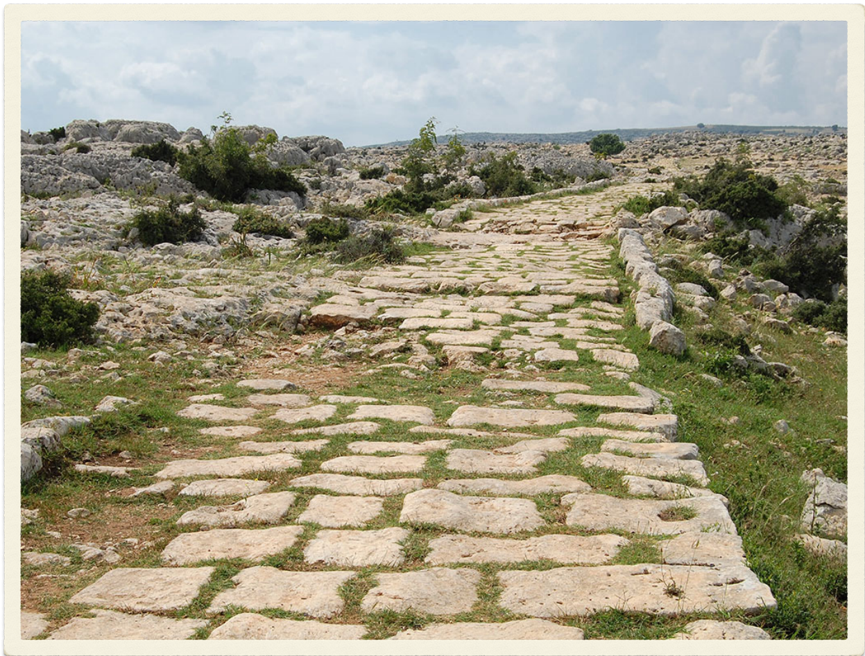
Ancient Roman Road near Saglikli, Turkey