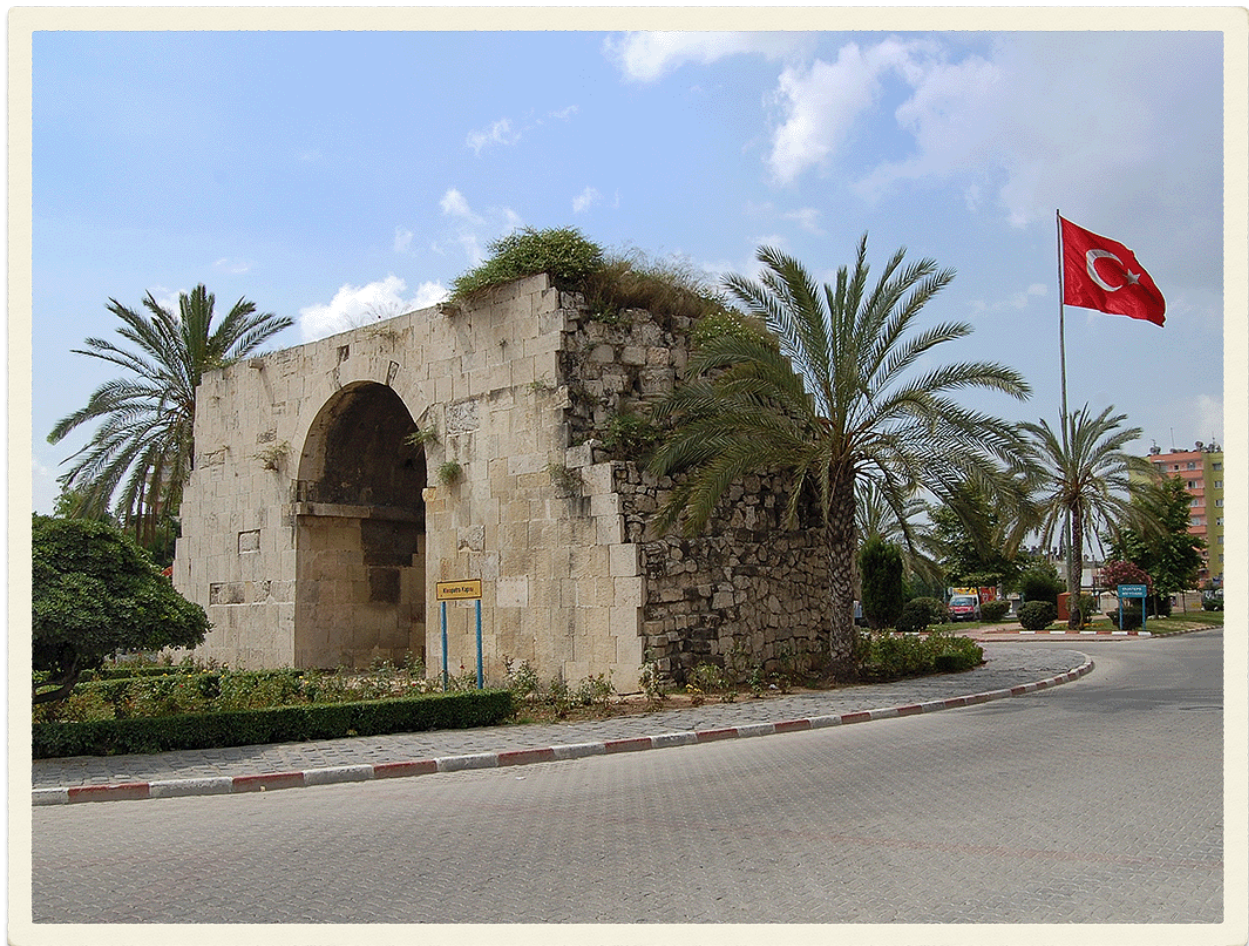
“Cleopatra’s Gate” in Tarsus