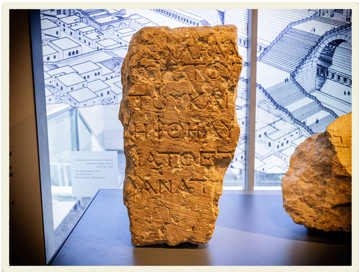
The Temple Inscription. The Israel Museum.