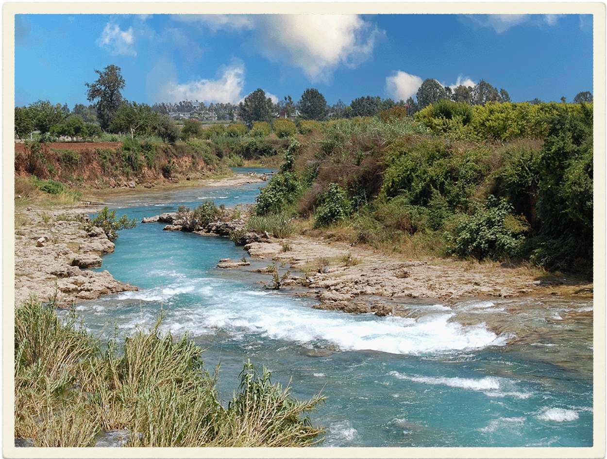
The Cyndus River in Tarsus