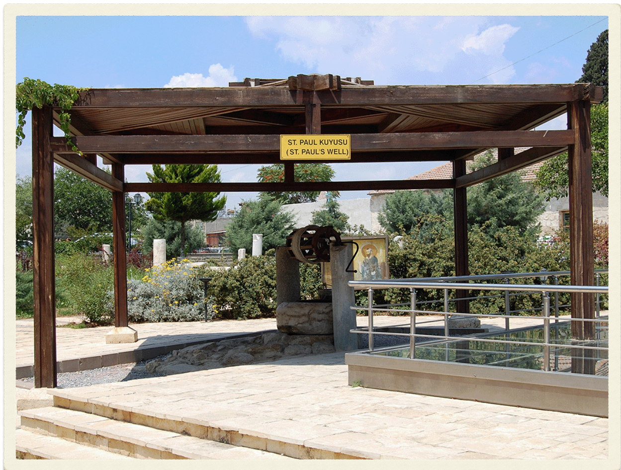
"Saint Paul's Well" in Tarsus