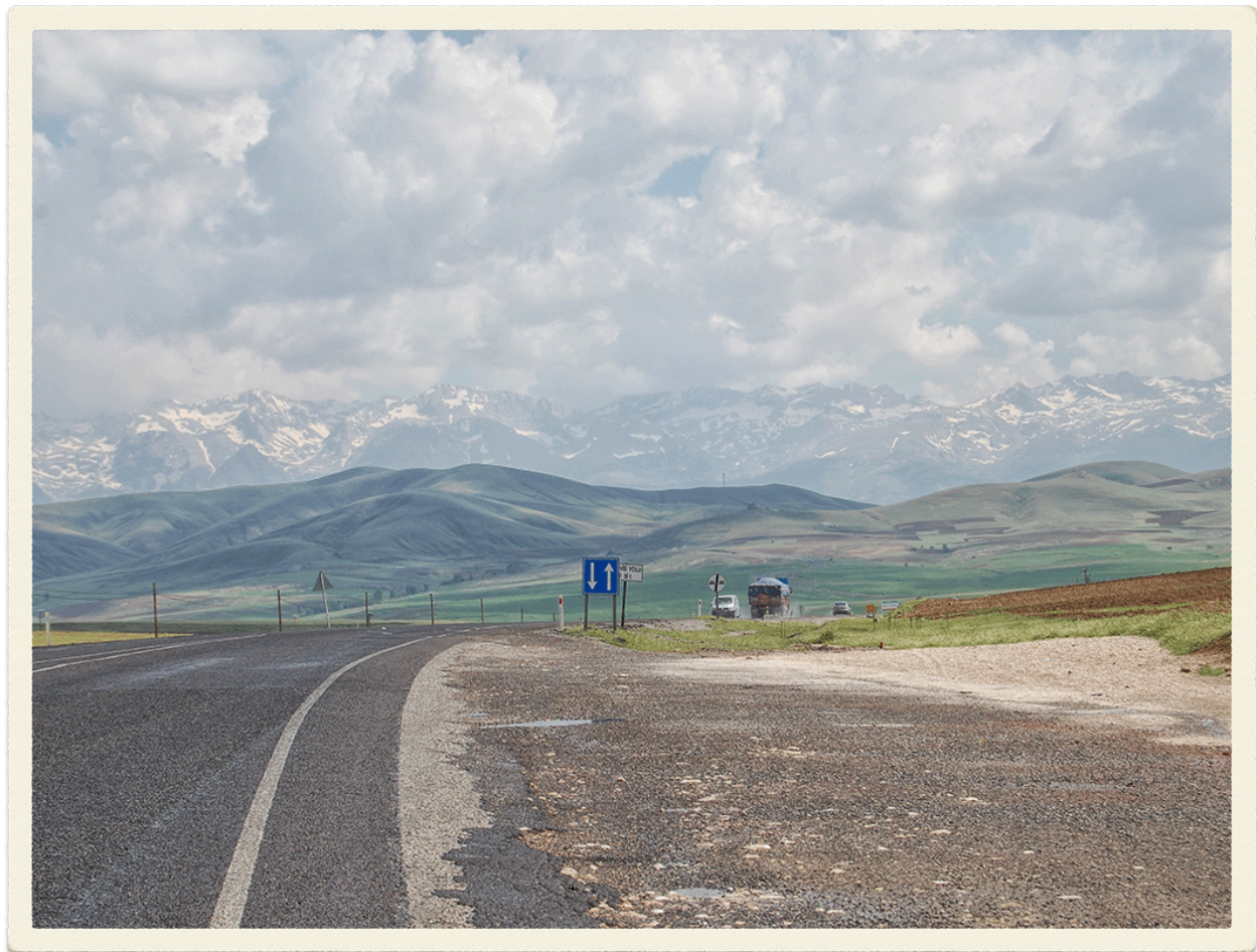
The Taurus Mountains