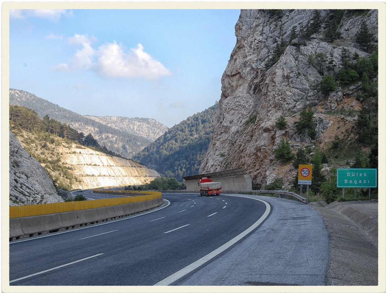
Third Pass through the Taurus Mountains

D. In the first century, Tarsus had a sizable Jewish population.