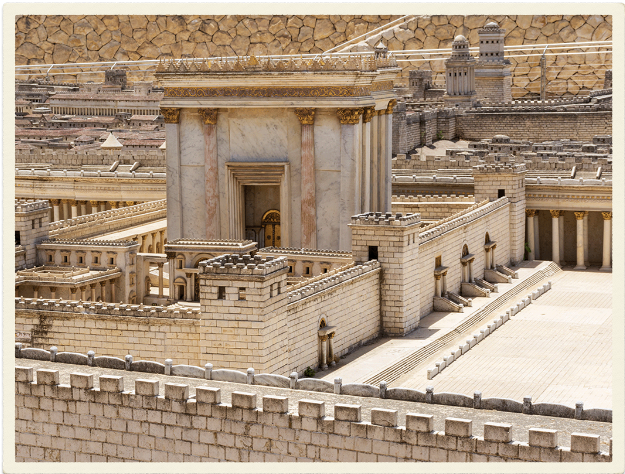
Model of Herod's Temple in Jerusalem