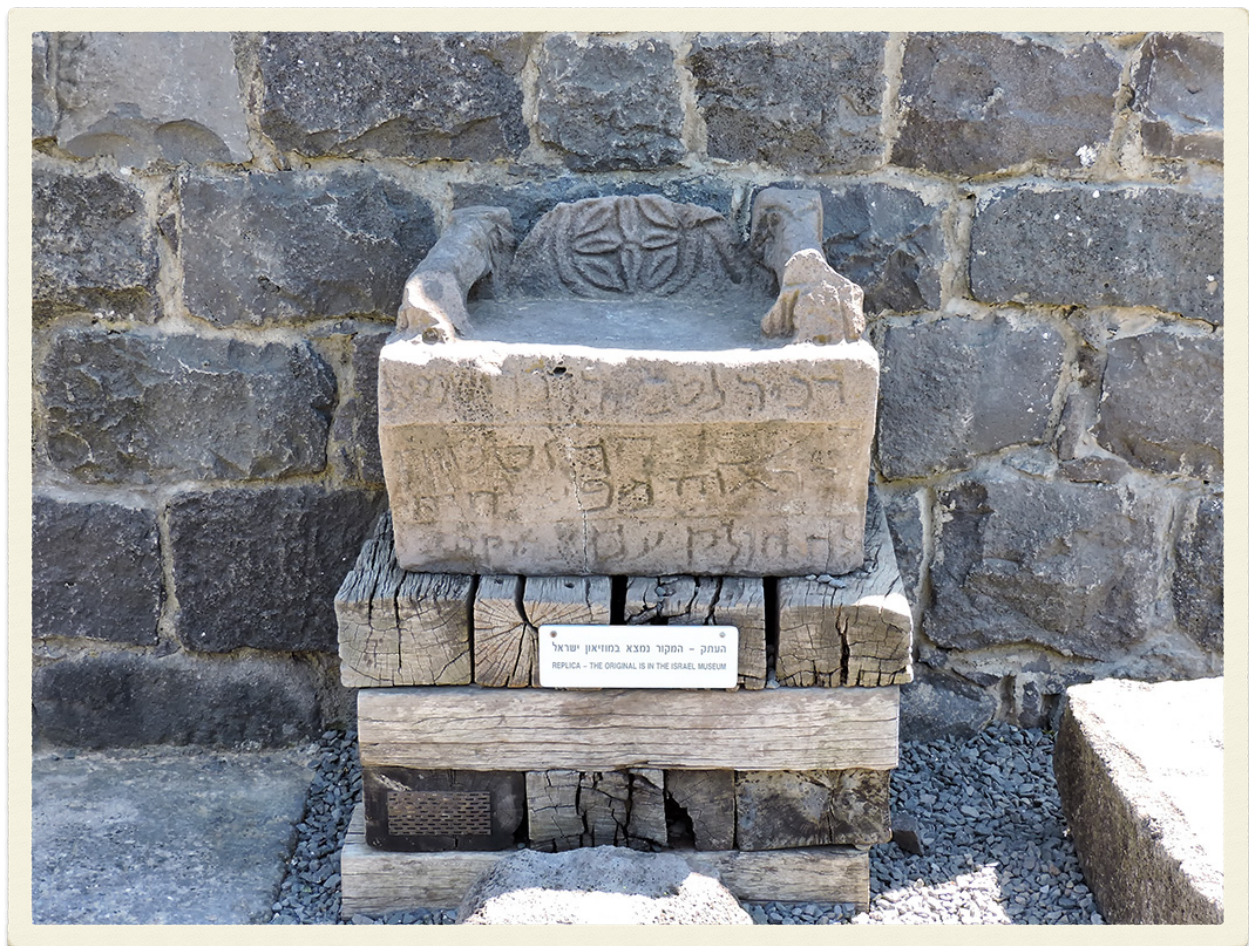
The “Seat of Moses” from Chorazin, Israel