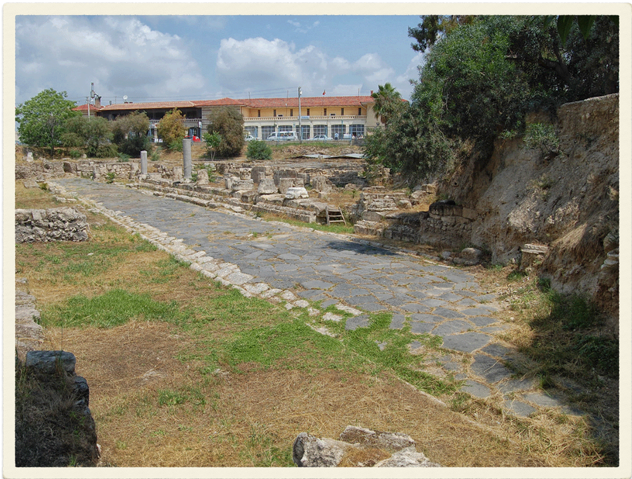
Ancient Roman Road in Tarsus