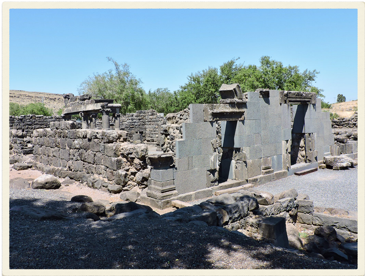
Ruins of the Synagogue at Chorazin, Israel