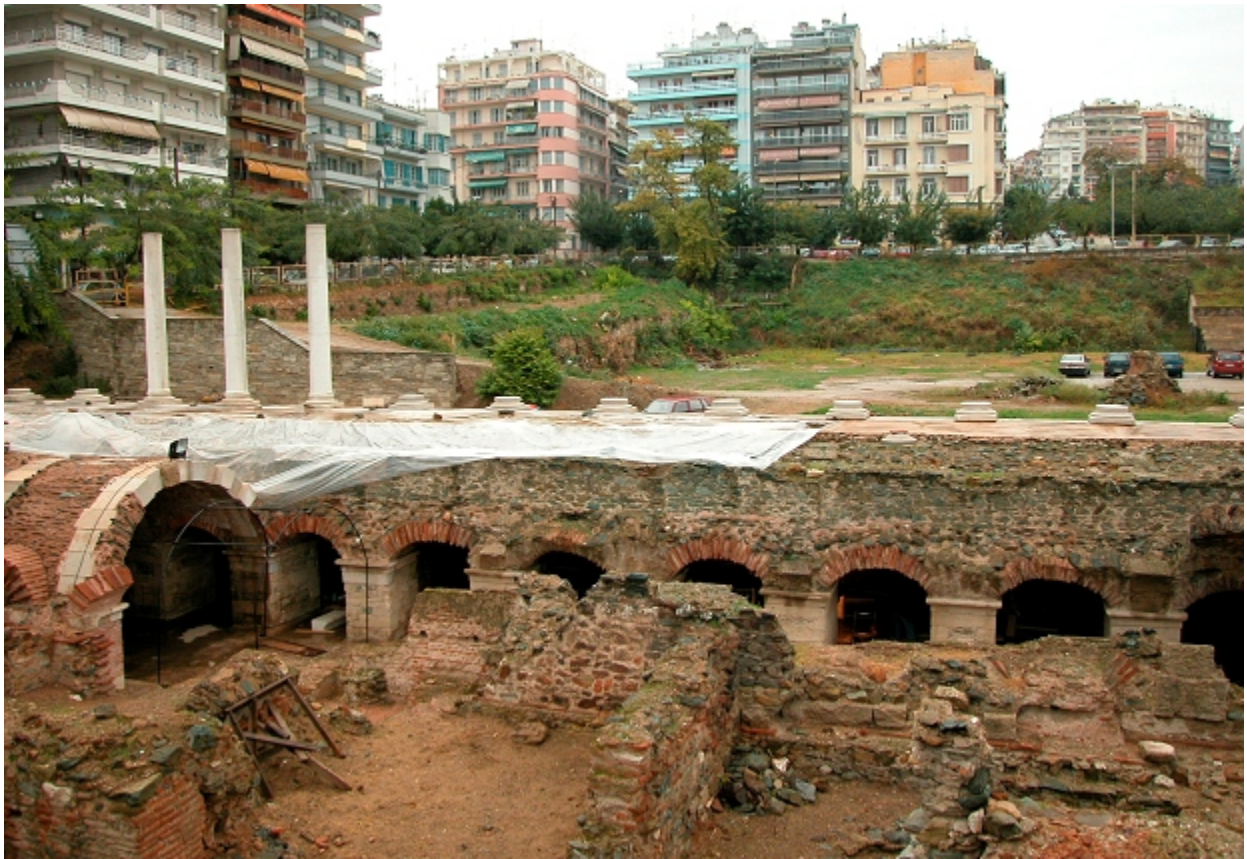
The Roman Agora in Thessalonica