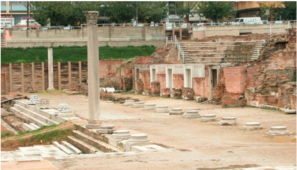
The Roman Forum in Thessalonica