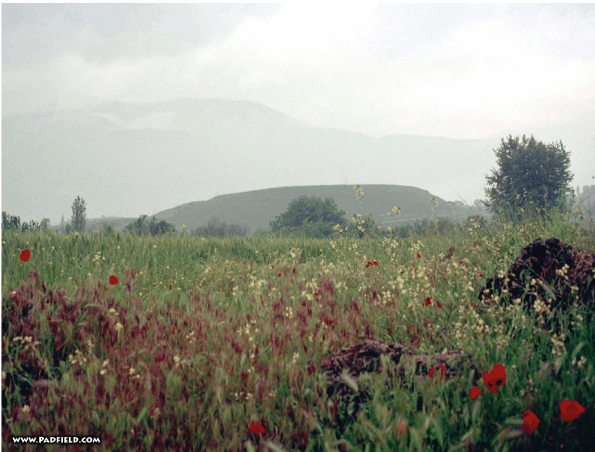
The Tell at Colosse - Looking from the South