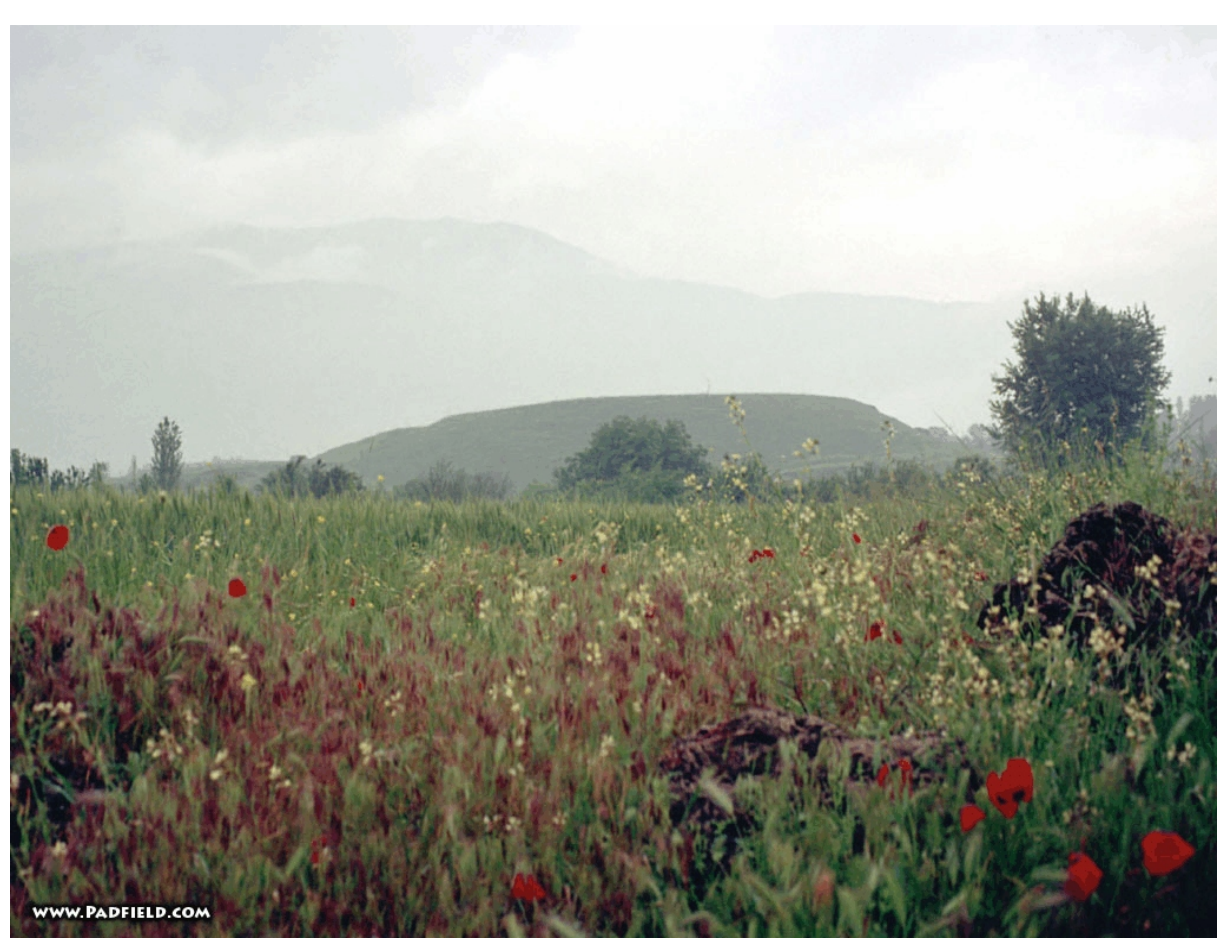
The Tell at Colosse - Looking from the South