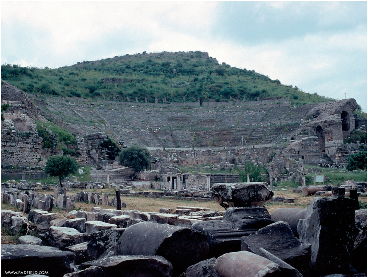
The Roman Theater at Ephesus