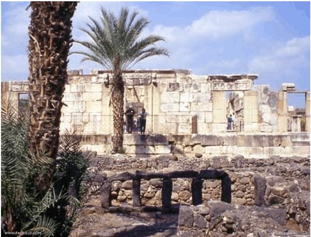
The Synagogue at Capernaum