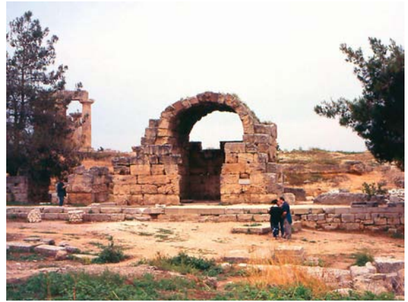
Sacred Fountain in Agora