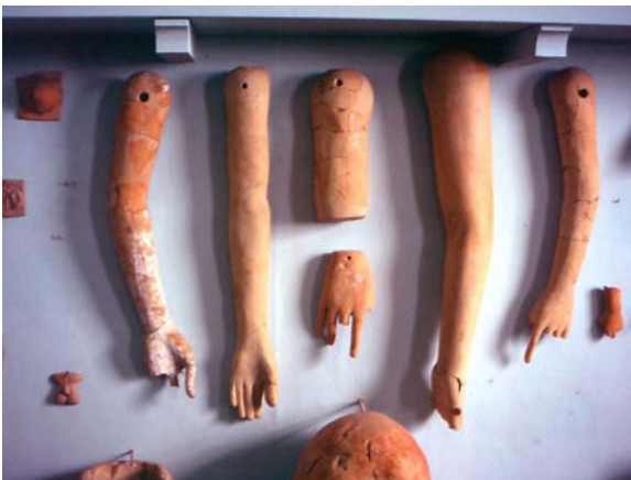
Ex Votos from Sanctuary of Asklepios