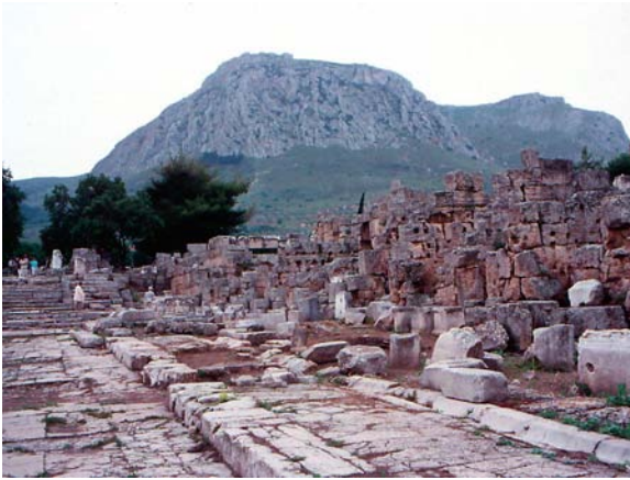
City Streets and Acrocorinth