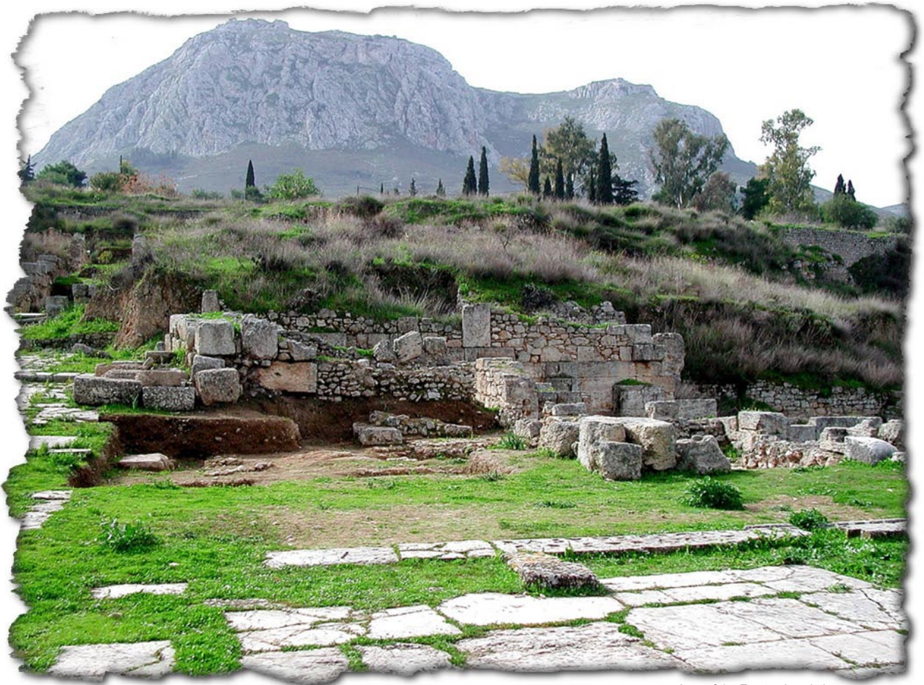
Area of the Erastus Inscription

“Paul, an apostle of Jesus Christ by the will of God, and Timothy our brother, to the church of God which is at Corinth, with all the saints who are in all Achaia...” (2 Corinthians 1:1)