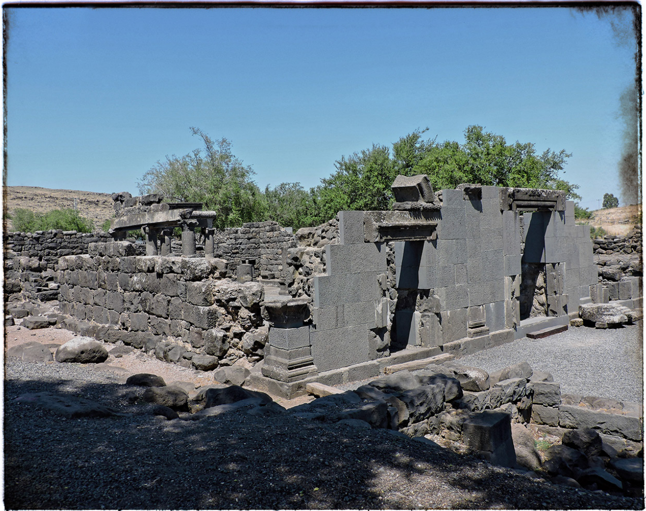
The Synagogue at Chorazin

“Woe to you, Chorazin! Woe to you, Bethsaida! For if the mighty works which were done in you had been done in Tyre and Sidon, they would have repented long ago in sackcloth and ashes.” (Matthew 11:21)