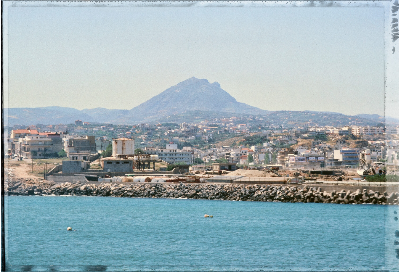
The Isle of Crete

"For this reason I left you in Crete, that you should set in order the things that are lacking, and appoint elders in every city as I commanded you" (Titus 1:5)