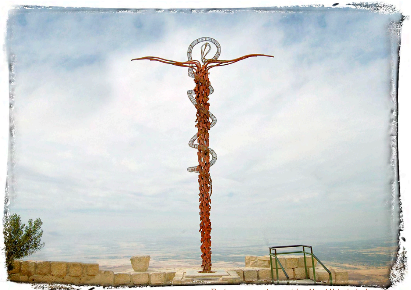
The bronze serpent memorial on Mount Nebo in Jordan

“I call heaven and earth as witnesses today against you, that I have set before you life and death, blessing and cursing; therefore choose life, that both you and your descendants may live” (Deut. 30:19)