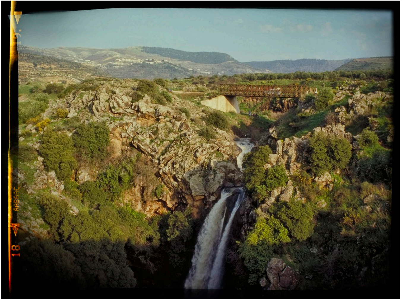
Saar Waterfall and Spring near Mount Hermon, Israel

“Though He slay me, yet will I trust Him. Even so, I will defend my own ways before Him.” (Job 13:15)