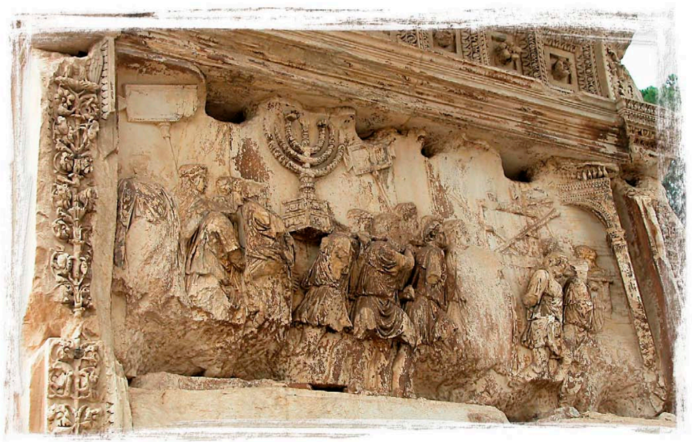
Detail from the Arch of Titus showing the sacking of Jerusalem. Note the Menorah being carried away. The monument is located on the Via Sacra just to the south-east of the Forum in Rome.

“Speak to all the congregation of the children of Israel, and say to them: ‘You shall be holy, for I the Lord your God am holy’” (Leviticus 19:2)